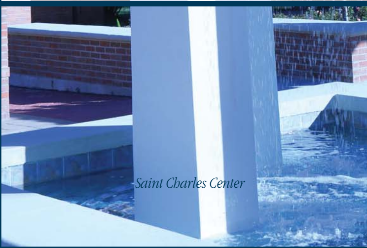
Saint Charles Center

>>> _____ hours a day, week, or month, to help others and myself return to the Lord.